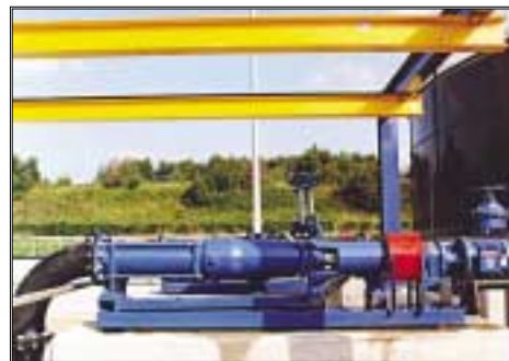
Simple or Complex System Packaging